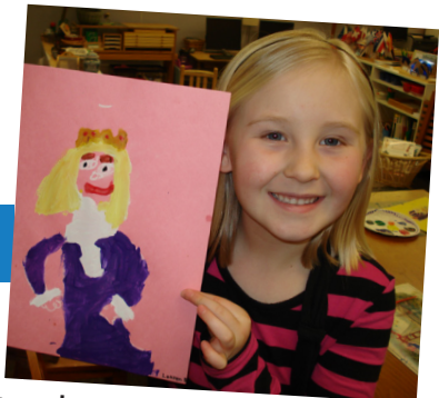
Proud 2nd Grade Artist showing "Artists Paint Kings & Queens"

Online and ready for use at any time with a web browser.