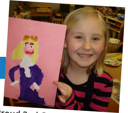
Proud 2nd Grade Artist showing “Artists Paint Kings & Queens”